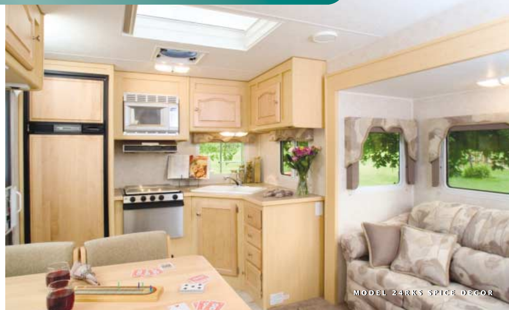
MODEL 24RKS SPICE DECOR