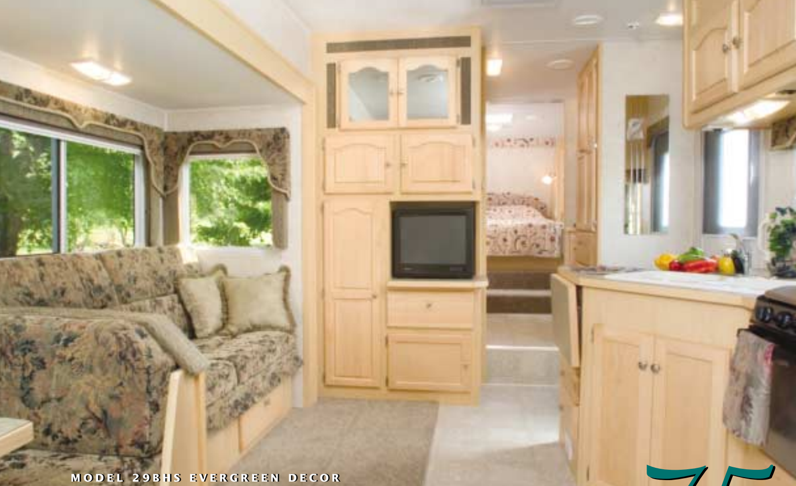
MODEL 29BHS EVERGREEN DECOR